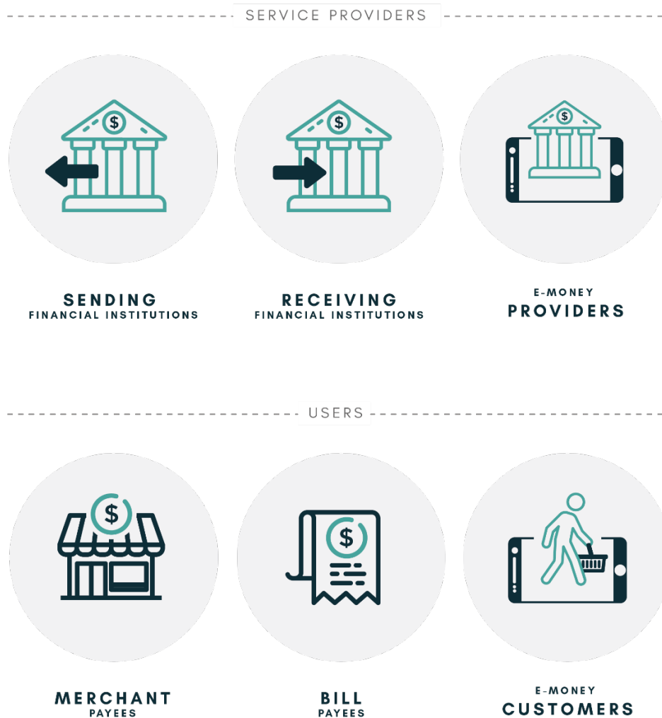
Figure 3.1. Mobile Merchant, Bill and Loan Payment

As with the issues raised with mobile P2P, potential competition issues include abuse of dominant position by the service provider (excessive pricing, unfair contract terms, cross-subsidization, forced bundling, and/or refusal to supply the service, either to the merchant or the retail customer) as well as collusion (fixing of pricing, segmentation of users). For example, Vodafone Idea, India’s largest MNO by subscriber base, 52 has